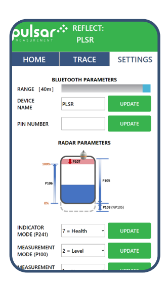
REFLECT™ Web-app Screenshots