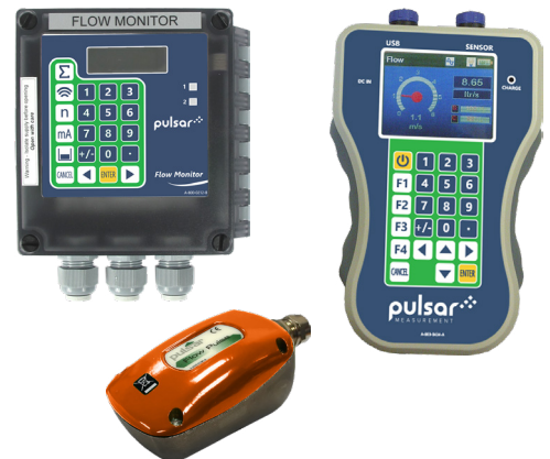
FlowPulse Optional Controllers

Optionally, there is also the Flow Monitor for fixed installation and the FlowPulse Handheld Controller for portable measurement requirements. Alternatively, the Greyline DFM 6.1 and Greyline PDFM 6.1 are suitable packages for pipe flow Doppler measurement. Please see the website or product brochures for more details.